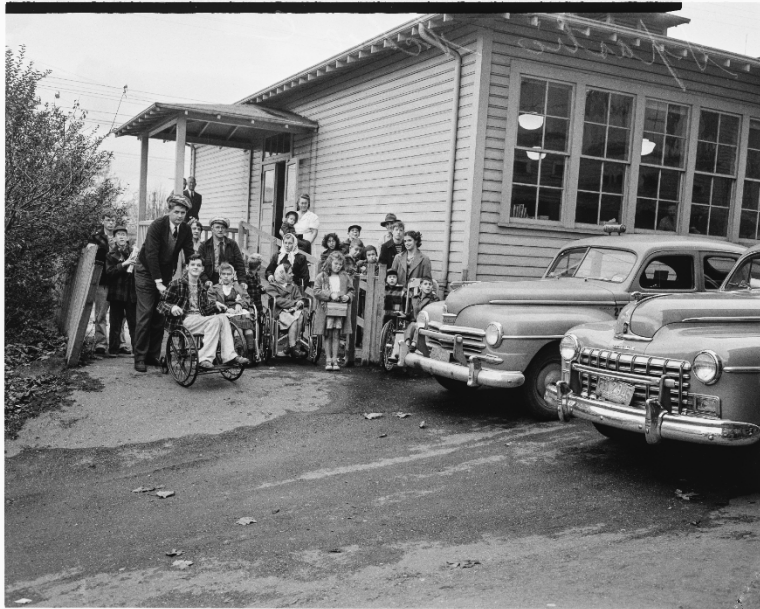
Black and white image of mid-century School for Spastic Children (Seattle)